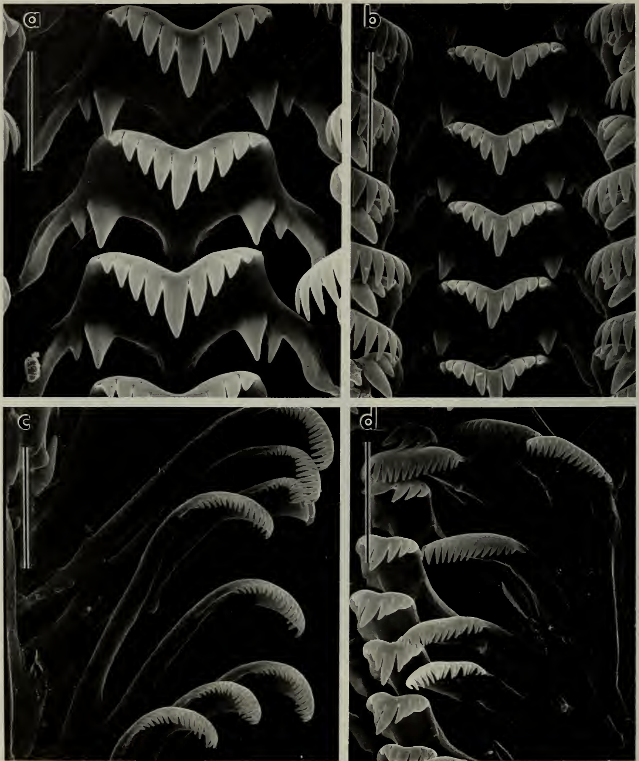
Fig. 3. Radula of A. sketi , USNM 860575. a. Central teeth (bar = 6 \mu\text{m} ). b. Central teeth (bar = 10 \mu\text{m} ). c. Outer marginal teeth (bar = 10 \mu\text{m} ). d. Lateral and inner marginal teeth (bar = 13.6 \mu\text{m} ).

males) or pronounced U-shaped loop (males) in posterior portion of pallial cavity; anus near mantle edge.